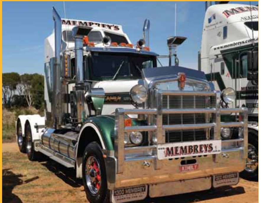
The Membrey display at the recent Tooradin truck show and tractor pull (above). Pride of the fleet is the latest Drake 10-line platform trailer (below).